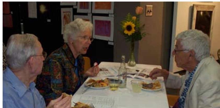
Fun was had by all the guests at the Local Foods Banquet at the Stewart Building in August. The event raised over $7,000 for Imagine Grinnell.