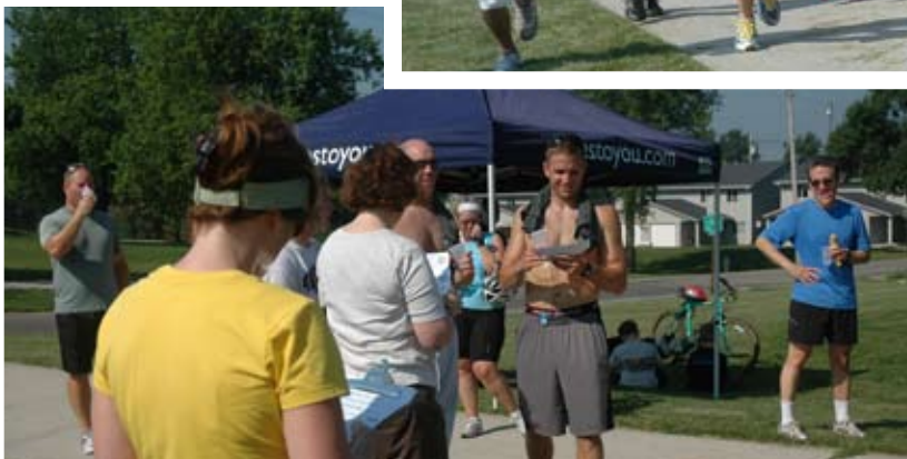
2nd Saturday bikers and runners off for a 5K, 10K, or 20K race on Saturday morning on the Grinnell Area Recreational Trail.