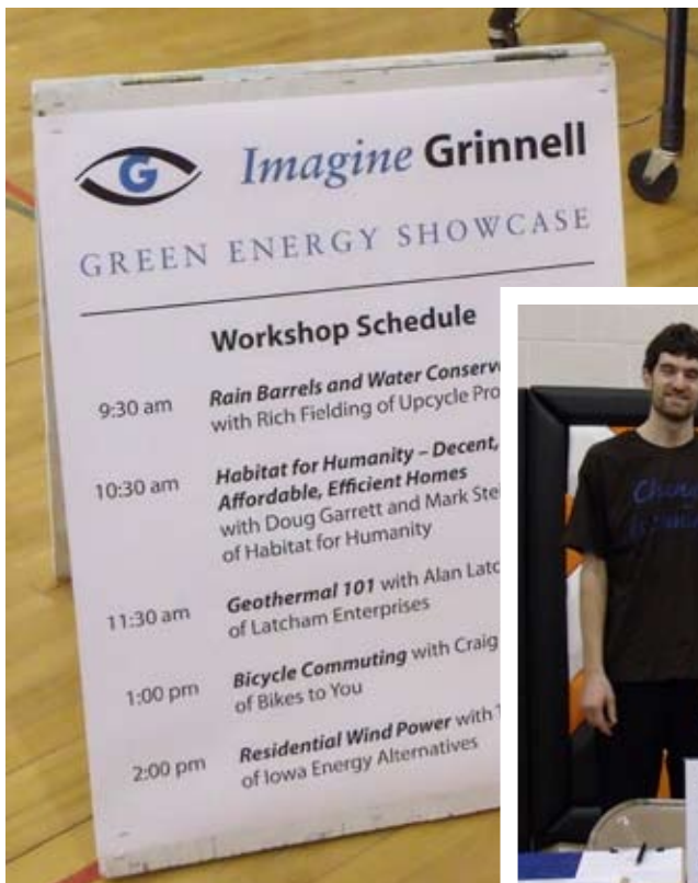
Imagine Grinnell held its first Green Energy Showcase in the Grinnell Home and Business Expo at the high school. Eight vendors took part in the showcase.

More than 115 people signed in at Imagine Grinnell's booth and more than 2,500 people attended the Home and Business Expo.